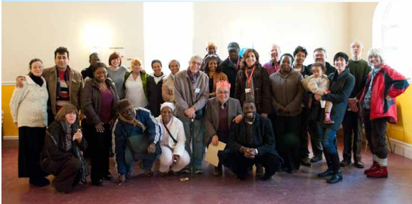
PAFRAS volunteers and staff line up for the obligatory group photo at our Christmas party.

Volunteers with PAFRAS have been at the forefront of caring for and assisting destitute asylum seekers for the last six years. I would like personally to publicly thank all the volunteers past and present who have contributed their time, energy and skills with such dedication to those suffering homelessness, hunger, disadvantage, isolation and abject poverty.